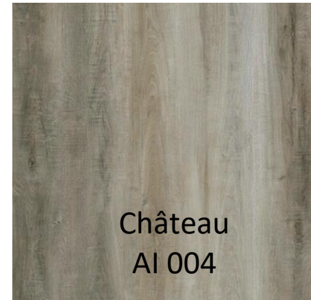
Château AI 004