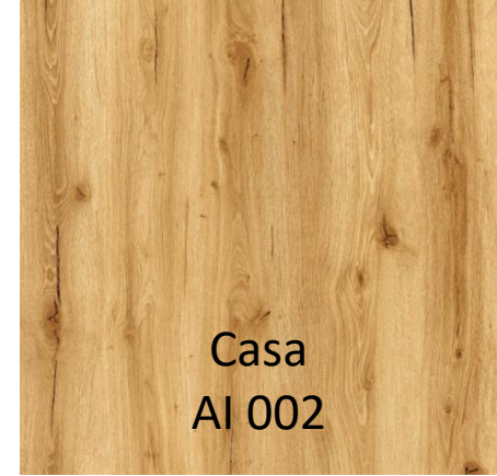
Casa AI 002