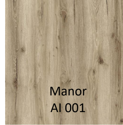
Manor AI 001