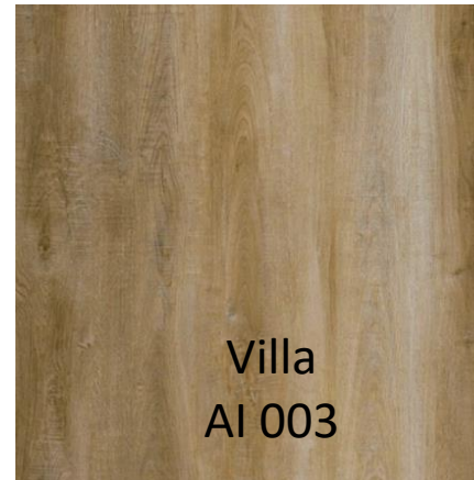
Villa AI 003